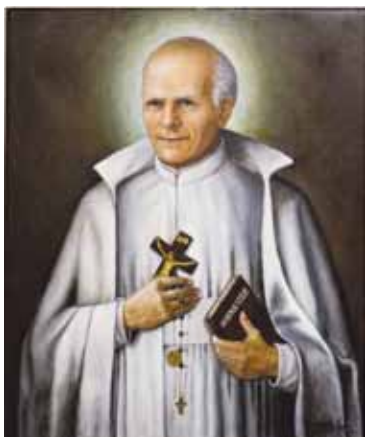
The Blessed Father Stanisław Papczyński