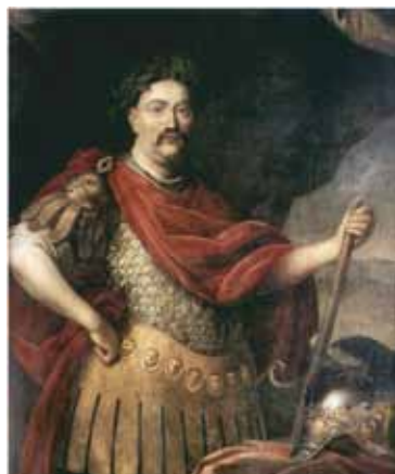
King Jan III Sobieski